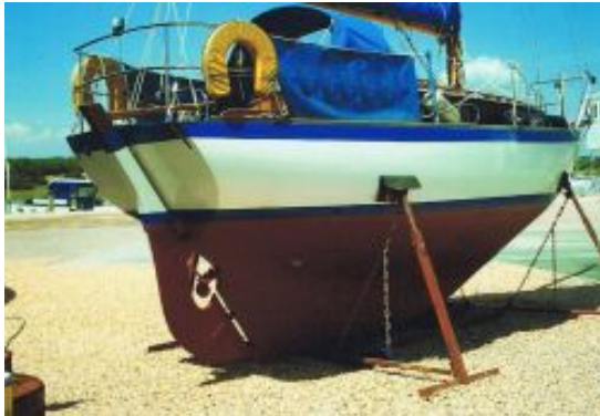
Out of the Water

The Company offers the details of this vessel in good faith but cannot guarantee or warrant the accuracy of this information nor warrant the condition of the vessel. A buyer should instruct his agents, or his surveyors, to investigate such details as the buyer desires validated. This vessel is offered subject to prior sale, price change, or withdrawal without notice.