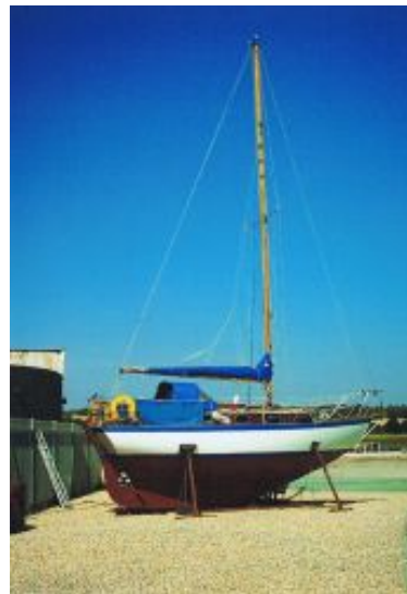
Out of the Water